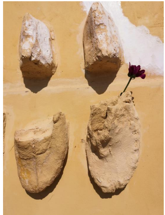
Porta d'Europa, dettaglio, Lampedusa