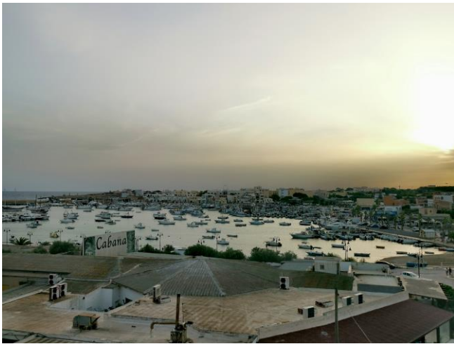
Vista del porto di Lampedusa