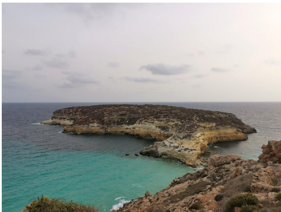
Isola dei Coniali. Lampedusa